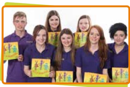
Elixir QE11 High School