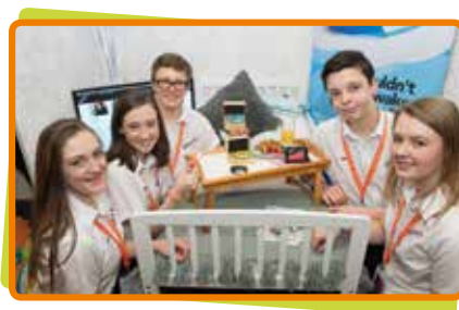
Progression+ QE11 High School