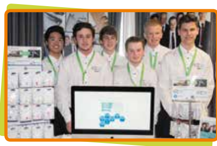
Opus QE11 High School

Caebo Sleeve to stop Apple cables from breaking and fraying