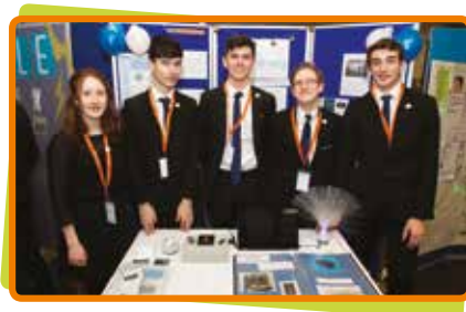
Solace Castle Rushen High School

Occativity – USB device to count customers