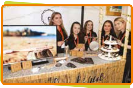
Gravity Ballakermeen High School